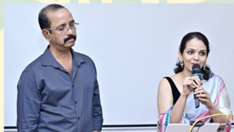
Music & Entertainment