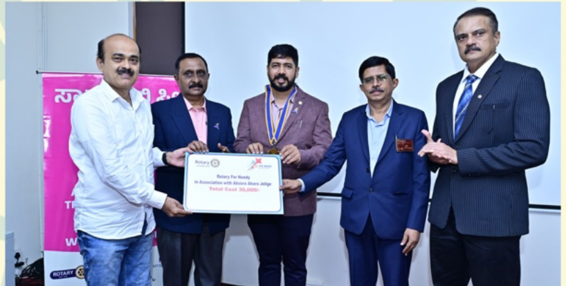
Joint Project with Akshaya Aahara Foundation