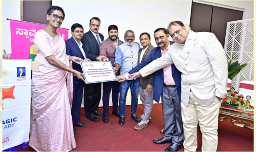
Project on Women Empowerment (Svavalambi Stree) with Rotary Mysore and Taliru Foundation was launched. This involves the training of economically and socially deserving women with skill development and as auto drivers over a period of 3 months.