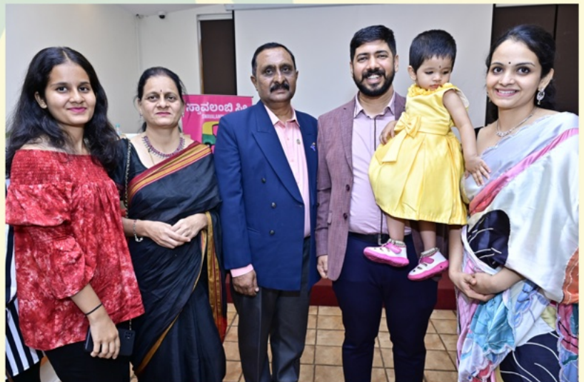
Leaders with Family