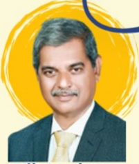
Vikramdatta Dist. Governor